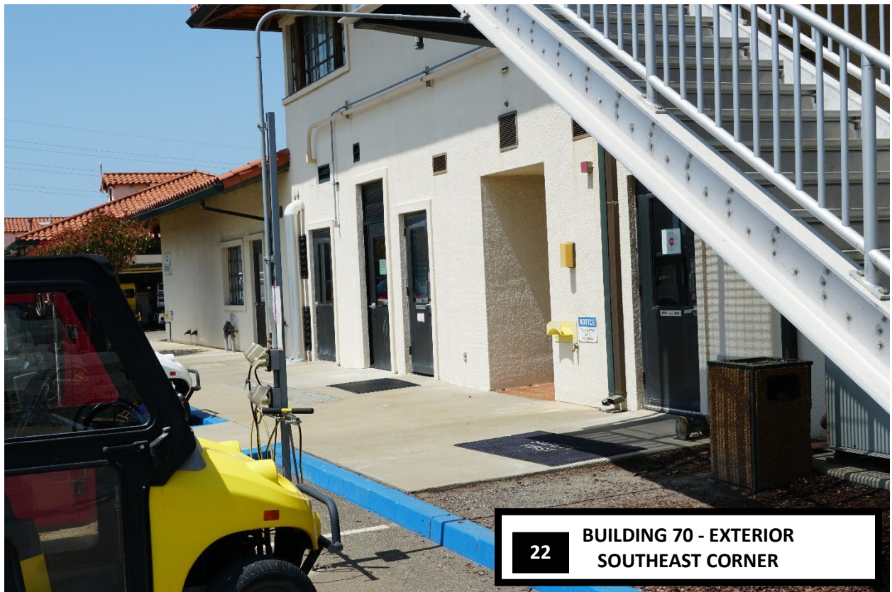
22 BUILDING 70 - EXTERIOR SOUTHEAST CORNER