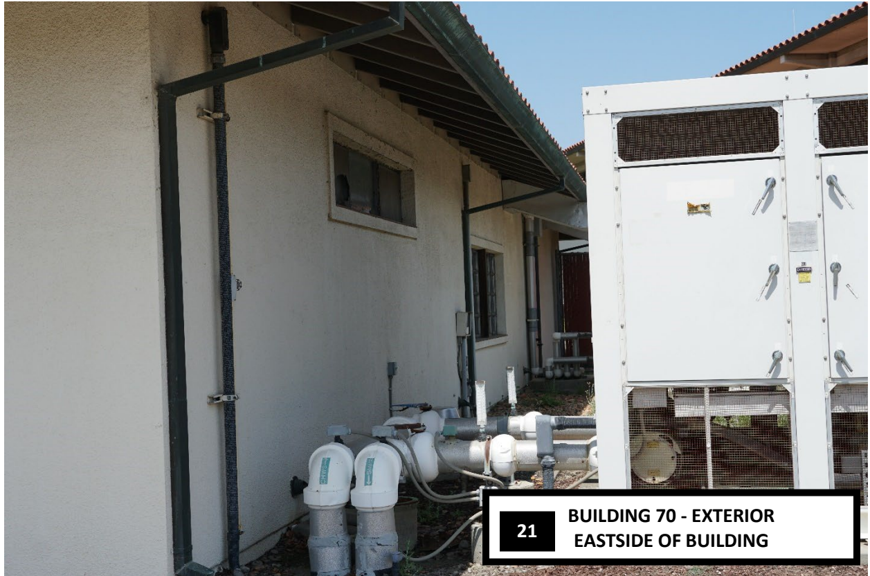
21 BUILDING 70 - EXTERIOR EASTSIDE OF BUILDING