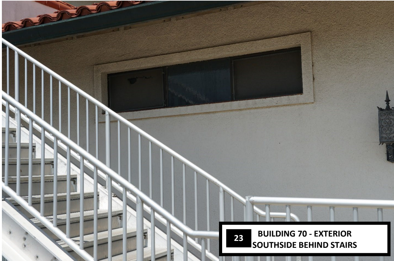
23 BUILDING 70 - EXTERIOR SOUTHSIDE BEHIND STAIRS