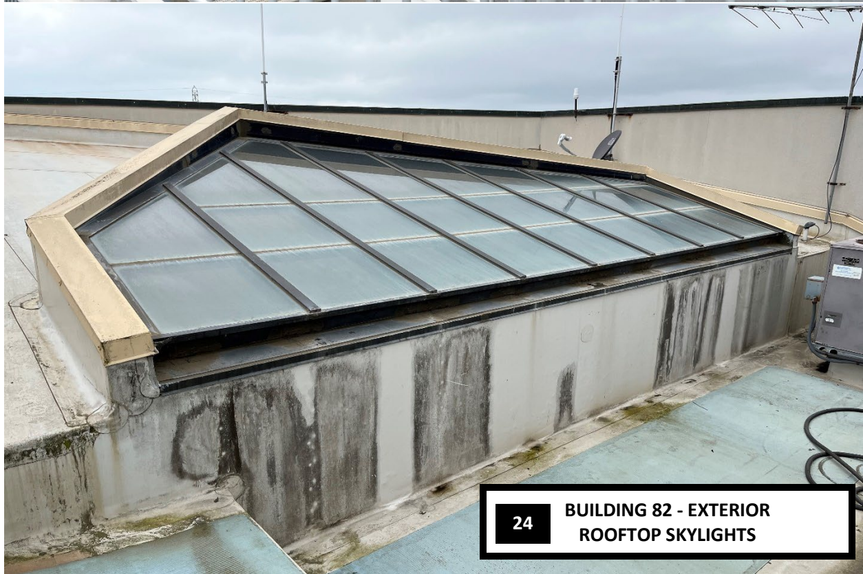
24 BUILDING 82 - EXTERIOR ROOFTOP SKYLIGHTS